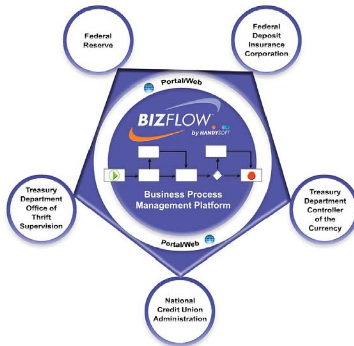
Figure 2: E-government using business process management to integrate and automate complex processes.

The solution for connecting all parties in government processes into a single, unified machine that supports productivity and collaboration in government is business process management , or BPM.